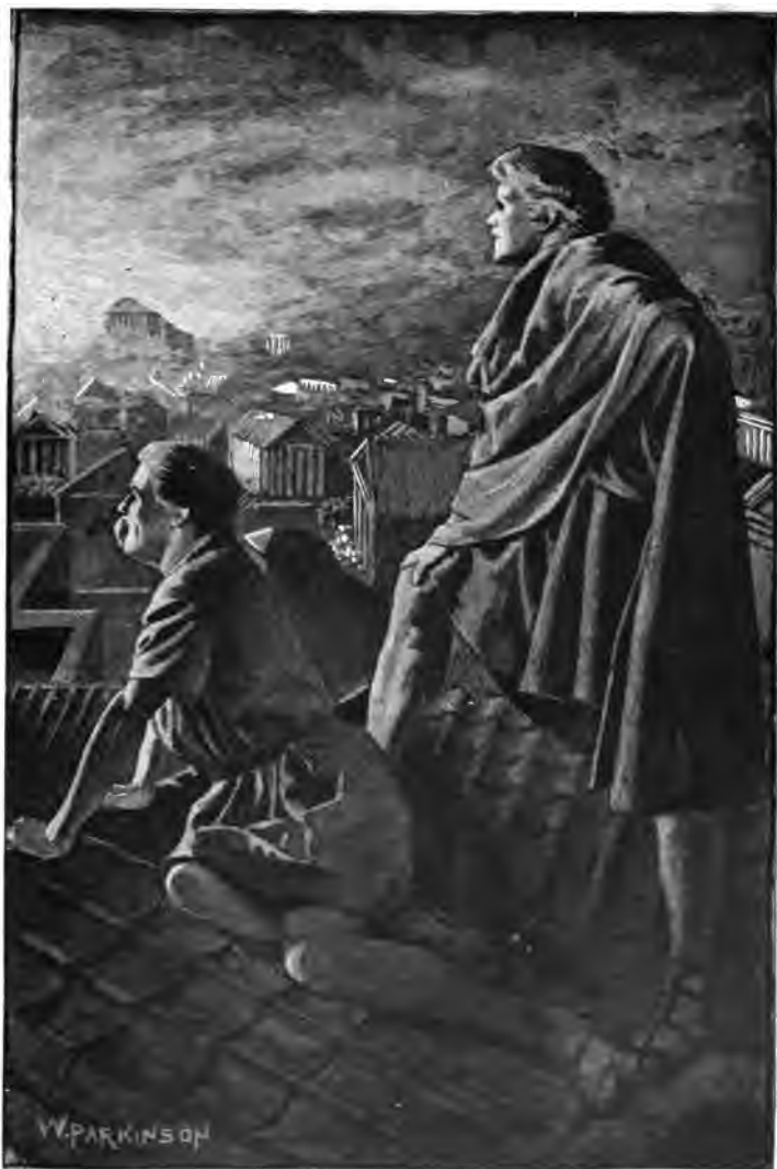
ROME IN FLAMES